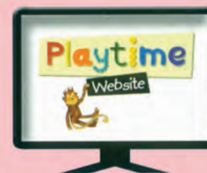
Parent and teacher website: • Songs • Games • Photocopiable resources