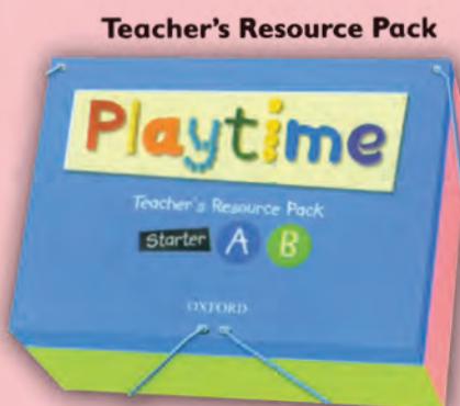
Teacher's Resource Pack