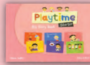
Big Story Book