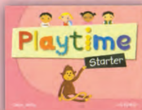
Class Book with stickers, pop-outs and mini flashcards