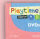
DVD • All stories animated